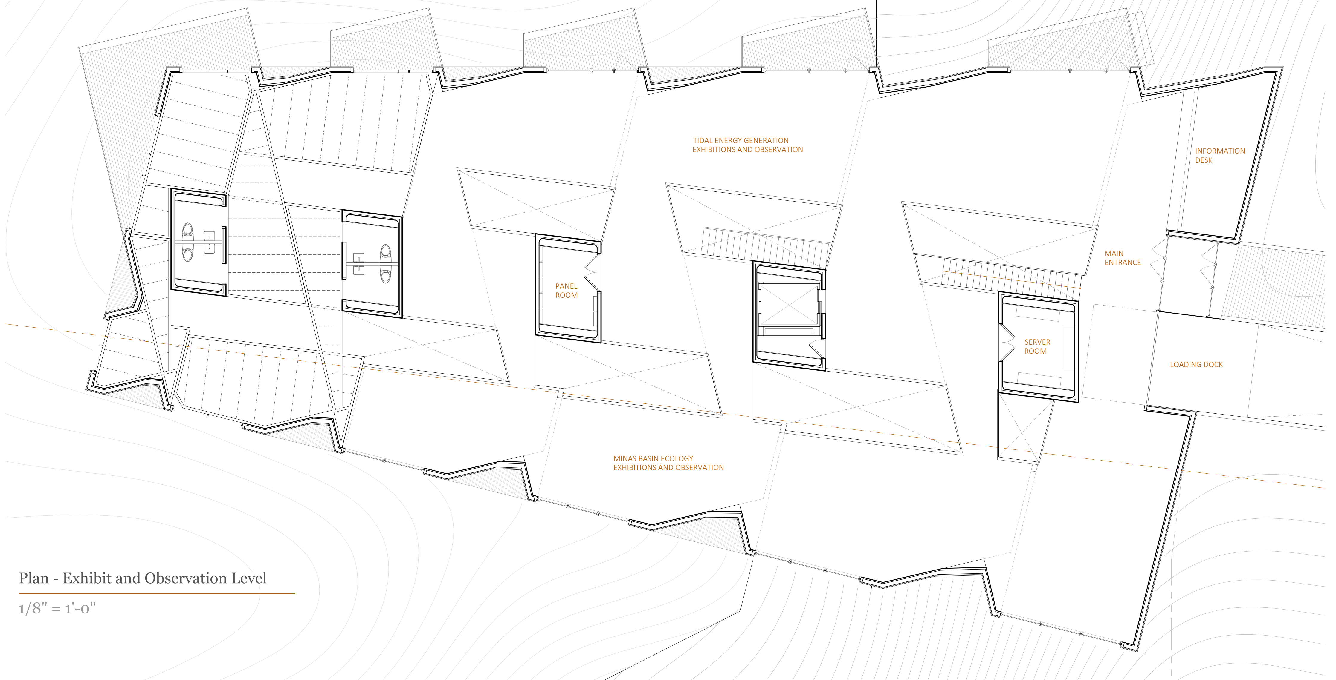
Plan - Exhibit and Observation Level