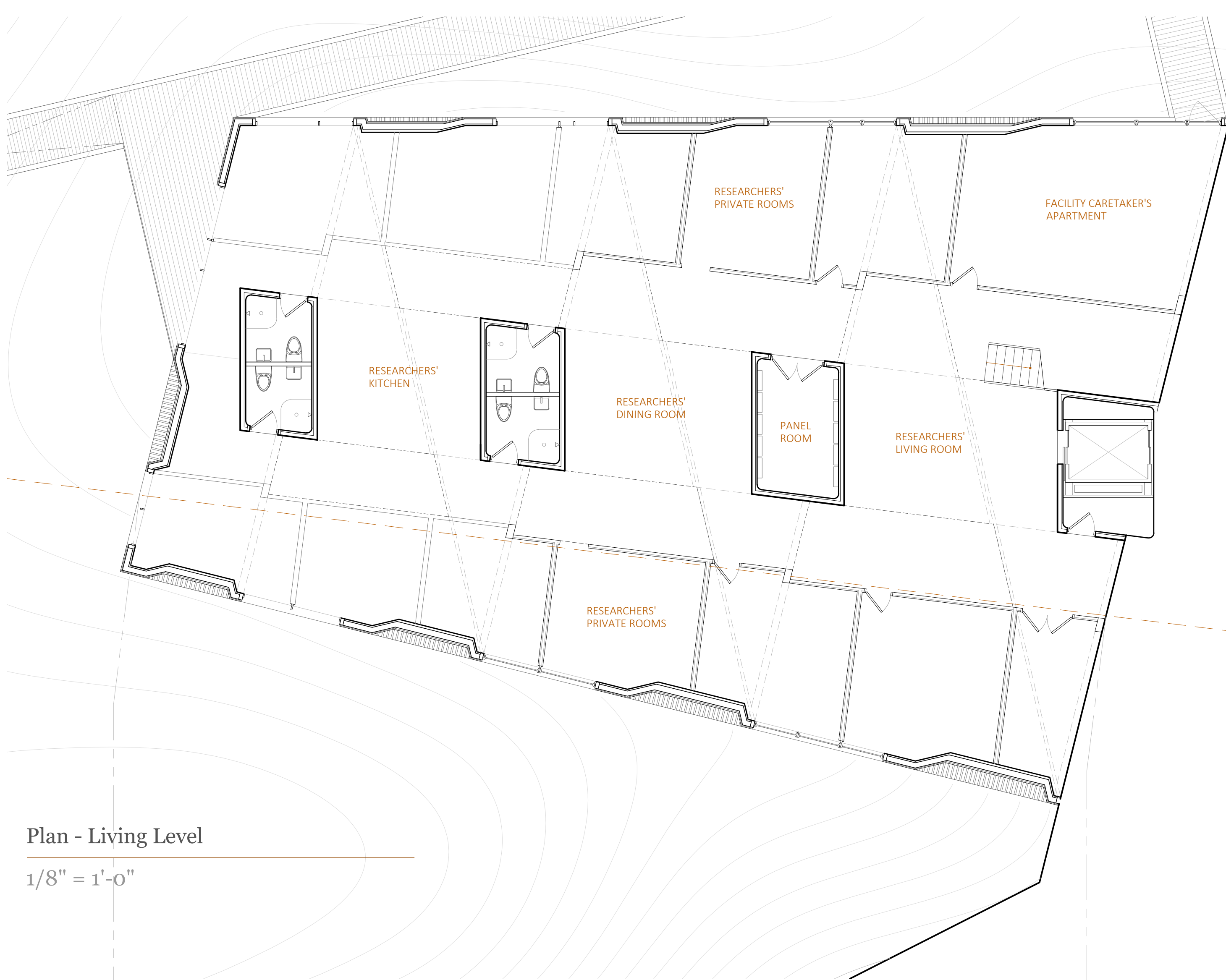
Plan - Living Level